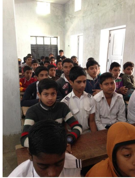
Sections of Kotchandpur Boy's High School students who received scholarships this year