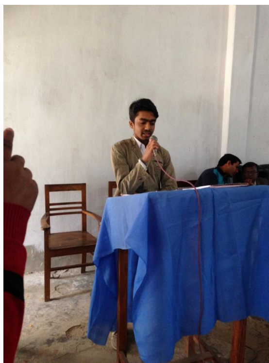
Kotchandpur Boy's High School students are reciting from The Quran and The Bhagabat Gita in the beginning of the Program.